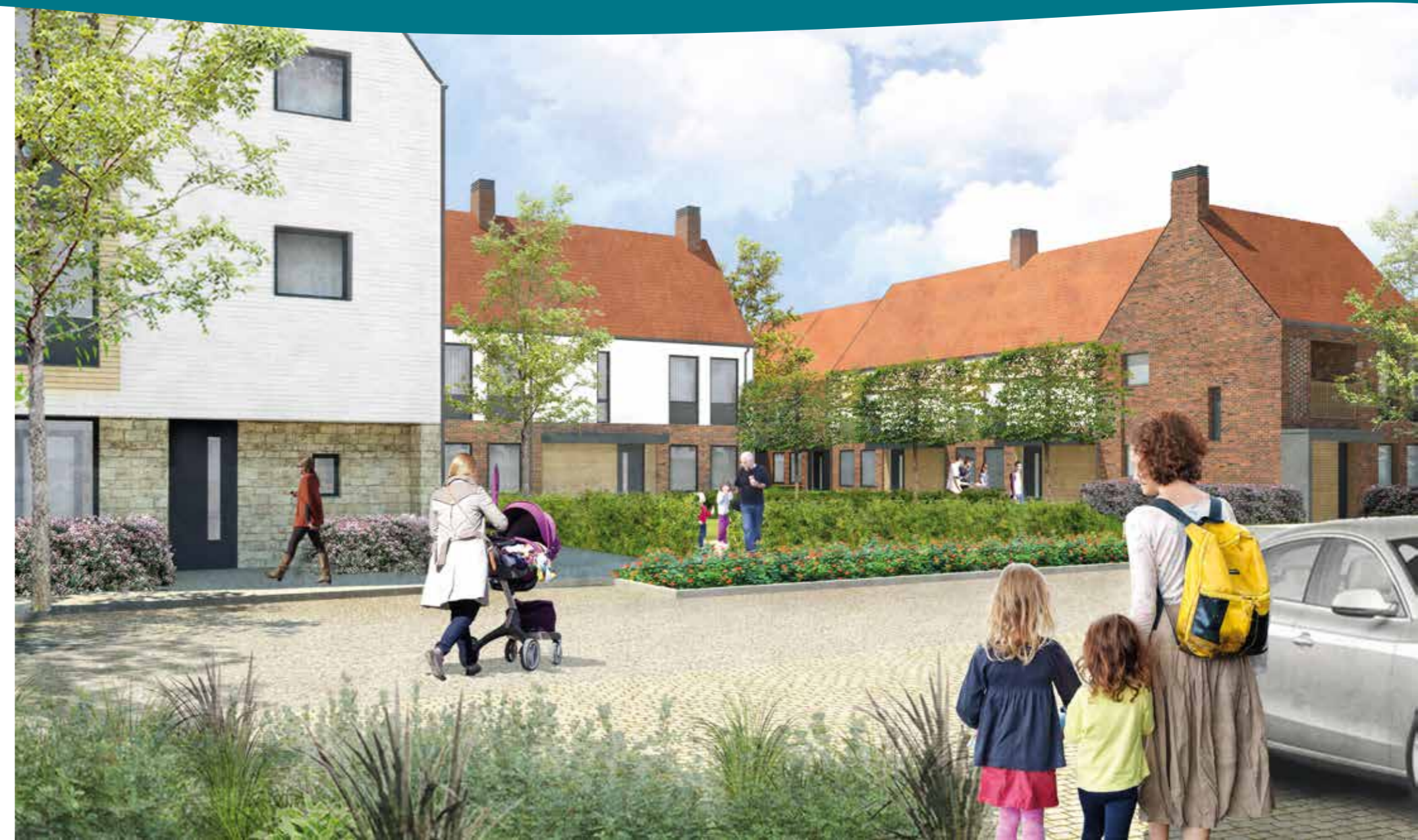
*Artist impressions of homes within Phase 5